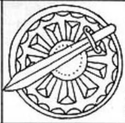
sword and shield